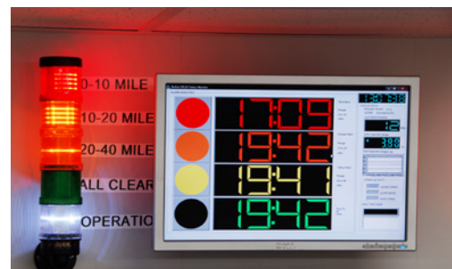
Stacklight connected to an ERL-10 (stacklight not provided)